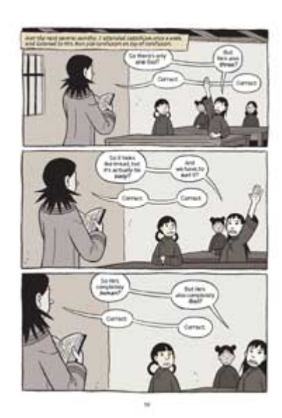
Click here for a larger image