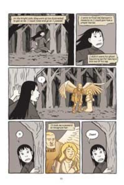
Click here for a larger image