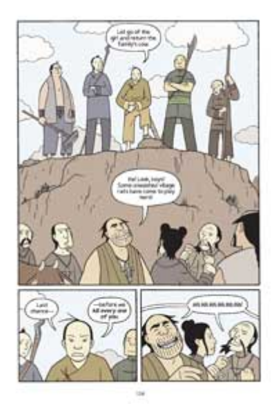
Click here for a larger image