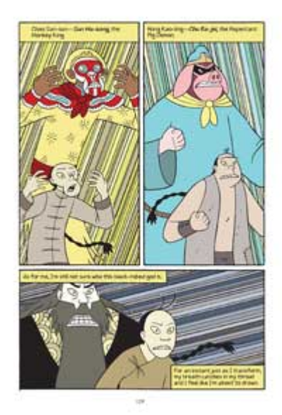
Click here for a larger image