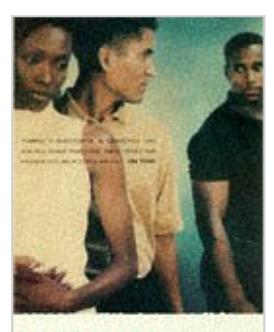
Invisible Life E. LYNN HARRIS