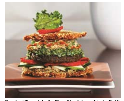
Read a "Tutorial of a Test Shot" from Linda Bellingham, author of More Food Styling for Photographers .