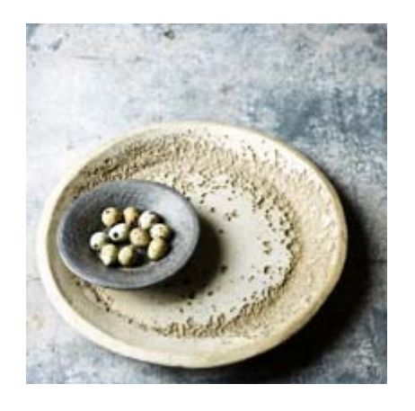
Read a letter from Jean Bybee, author of More Food Styling for Photographers , on test photography.