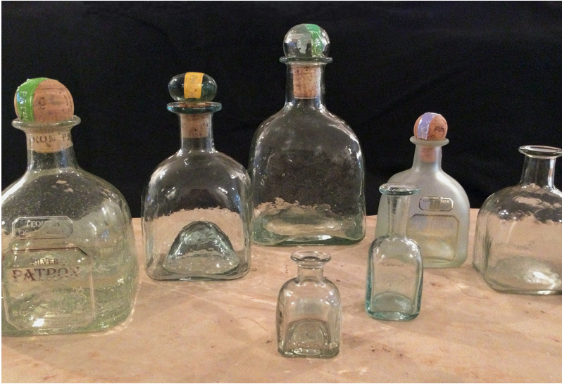
Patron Bottles: A sampling of the Patron bottle evolution, beginning with one of the early glass stopper versions (second from left).